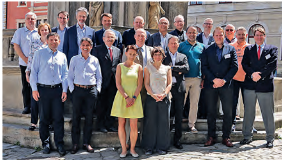
Cesky Krumlov 2019

CETOP General Secretariat Lyoner Straße 18 · 60528 Frankfurt am Main · Germany