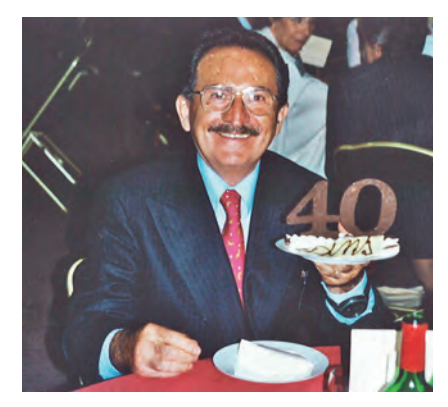
Brussels 2002 · 40th anniversary of CETOP