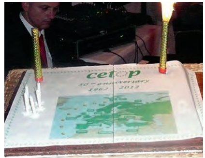
Paris 2012 · 50th anniversary of CETOP