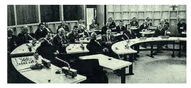
Conference of the CETOP Technical Commission Oil Hydraulics, Düsseldorf 1965